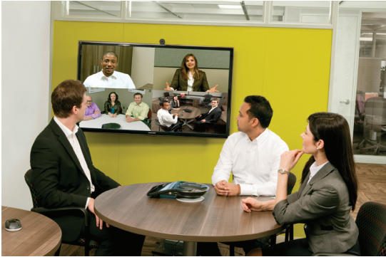
Mitel UC360™ Next Generation Collaboration