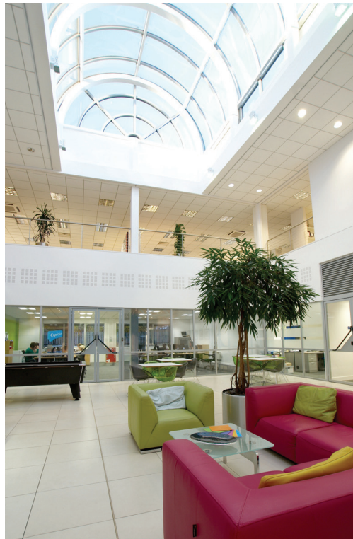
Space Group’s headquarters

Workers will appreciate significant time and cost savings too, as commutes are moved off-peak or eradicated completely, and the average worker commute of over 200 hours a year is reduced dramatically.